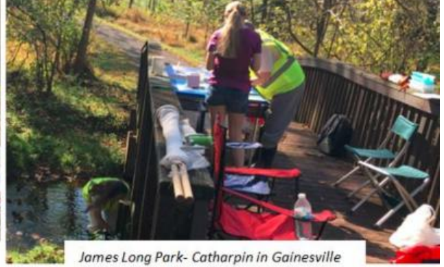
James Long Park- Catharpin in Gainesville