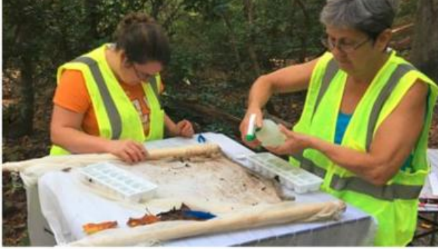
Water Quality Monitoring at Airport Creek