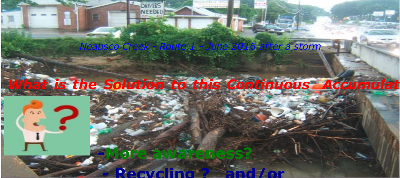
Neabsco Creek - Route 1 - June 2016 after a storm