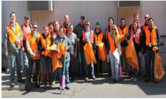
Micron Technology, Inc. Staff