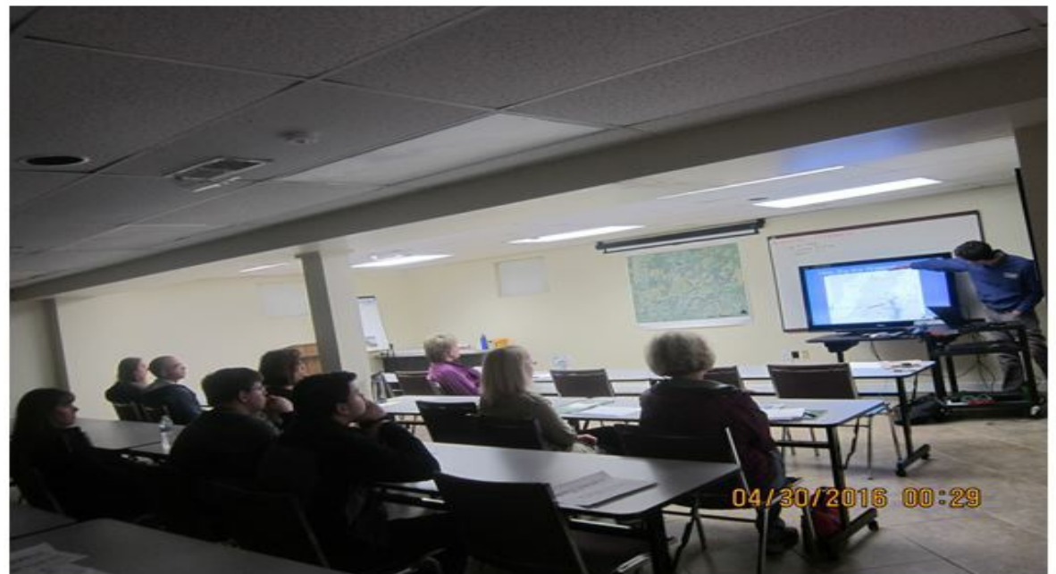
Introductory Training of Water Quality Monitors (Cooperative Training Event- Prince William and Northern Virginia Soil & Water Conservation District.

How can Prince William streams be trash free?