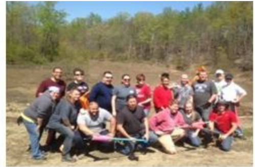
Habitat for Humanity & Strayer University Volunteers

This spring, some businesses, organizations, Home Owners Association (HOAs), students, and families geared efforts towards cleaning up some portion of local streams and waterways in Prince William County under the Adopt a Stream program. The District's cleanup programs also help to promote environmental awareness around local streams within the different communities.