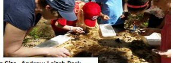
STEM Water Quality Monitoring Site- Andrew Leitch Park