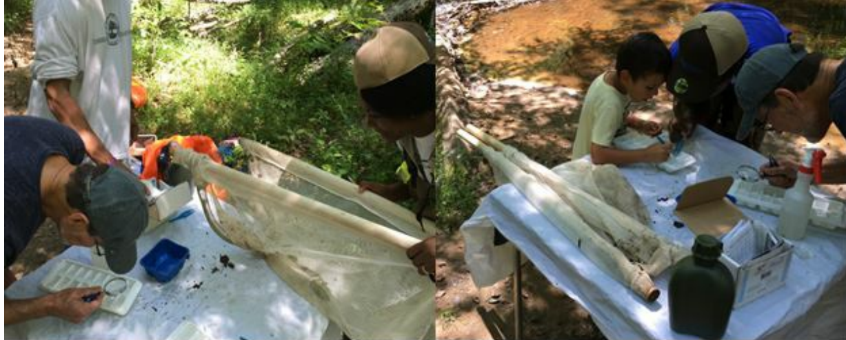
Water Quality Monitoring at Prince William Forest Park - Quantico Creek Watershed