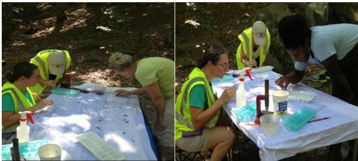
Water Quality Monitoring at Airport Creek – Occoquan Watershed